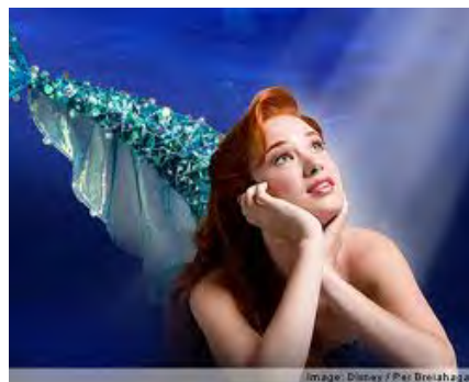
"Okay, I may not look real. But I'm honest!"

8. Here's how I think fear gets in the way of telling the truth: _____